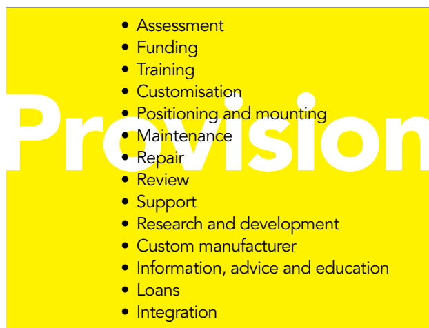
Figure 2: Components required for AAC service provision (including powered aided communication)

The full research report contains the agreed definitions for each service component.